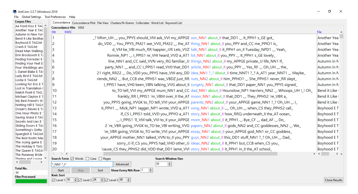
Figure 1 Sample of query results using the POS-tag sequence 'noun + preposition'.

The concordances retrieved through the search for POS-tag combinations in AntConc were manually checked to prevent false positives, and in some cases, concordances were sorted into categories following functional criteria. For example, Figure 1 displays the concordances obtained when searching for nouns followed by prepositions. Since these contained both post-modifying and adverbial PPs, the occurrences needed to be sorted into two categories. Once the data were cleaned and sorted, frequencies of occurrence were normalised per 100,000 words.